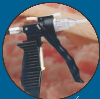
• Insta-Flo Gun and Nozzle