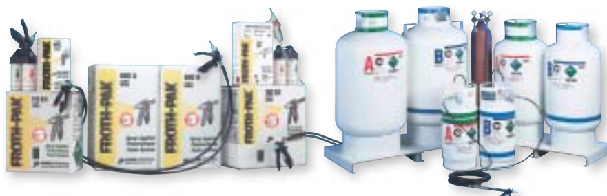
• Froth-Pak Disposable Kits